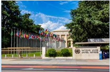
Meeting of the working group of member-states of the Biological Weapons Convention (7-21 August 2023, Switzerland, Geneva)