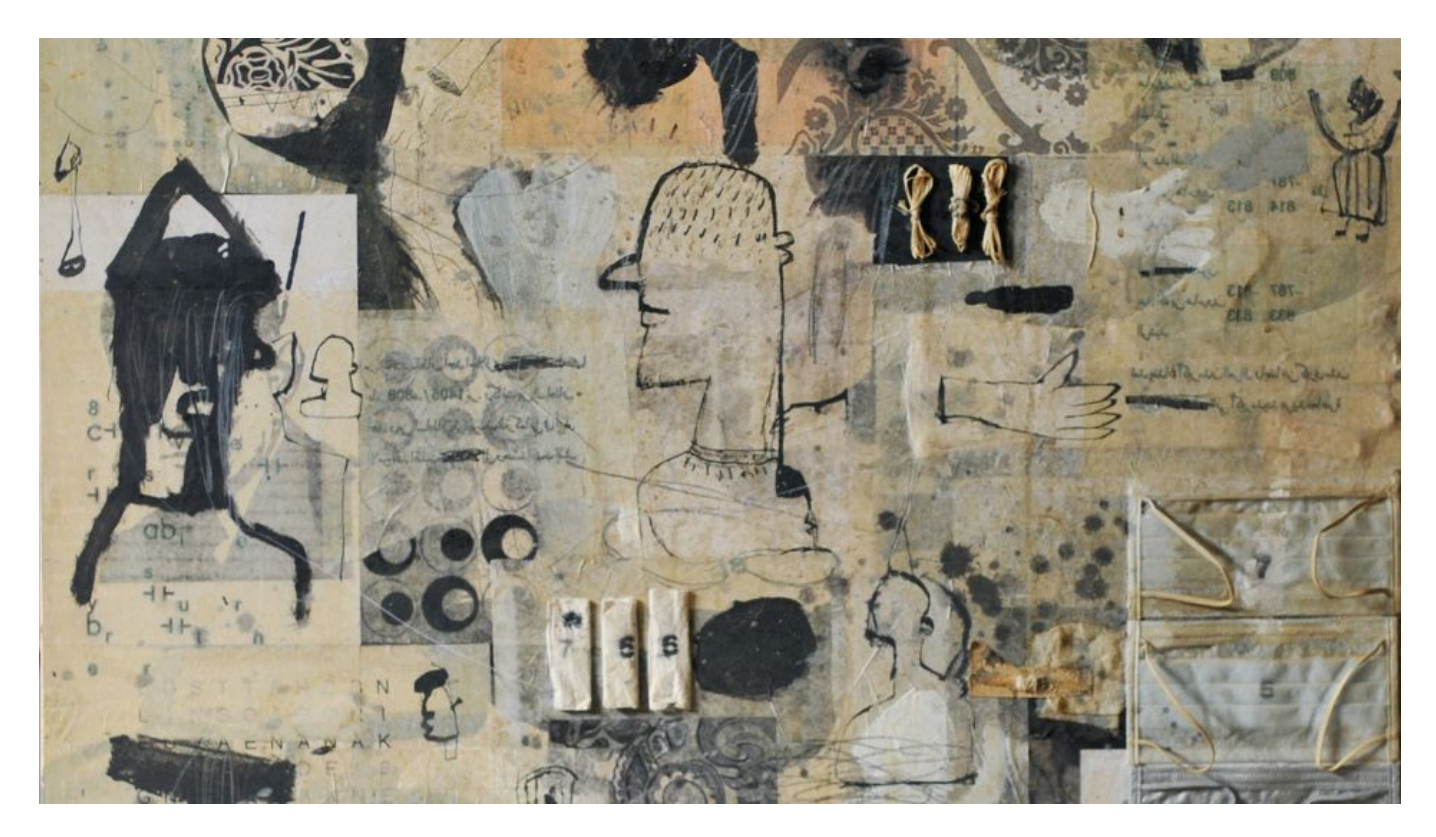
Mahmud al-Obaidi (Iraq), Untitled, 2008.

The analysis in the texts is detailed, relying upon public databases and databases built by GSI. The bottom line is that there is one world system that is managed dangerously by an imperialist bloc. There are no multiple imperialisms, no inter-imperialist conflict.