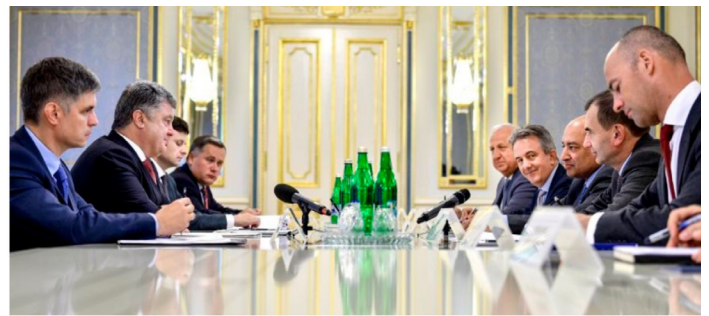
The EBRD delegation meets Ukraine’s President Poroshenko in Kiev.