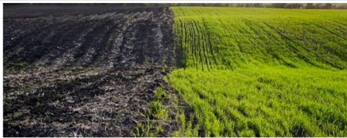
Friends in the Dnepropetrovsk region, Ukraine. Inefficiently managed resources, including agricultural land, remain a drag on growth