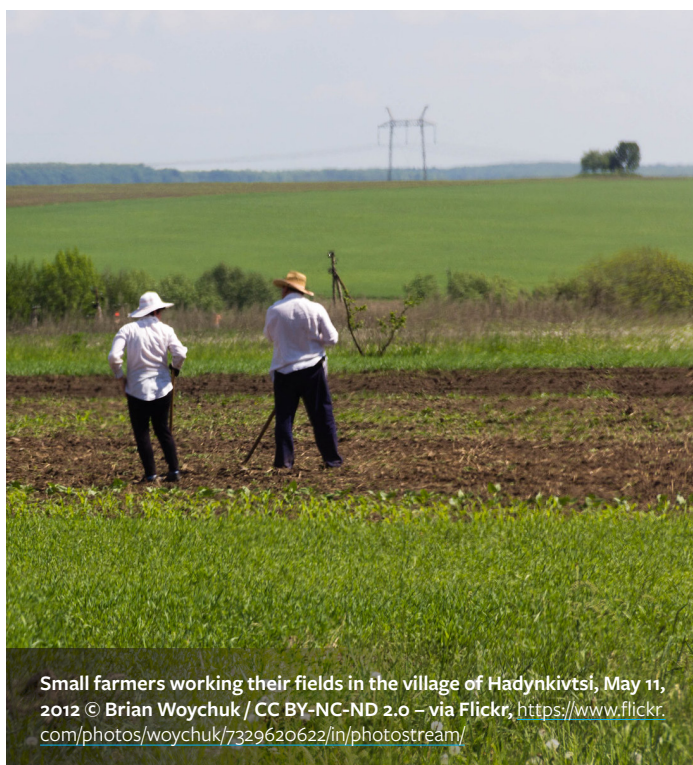
Small farmers working their fields in the village of Hadynkivtsi, May 11, 2012

The above can be the basis for the transformation of the agricultural sector in Ukraine to make it more democratic, environmentally, and socially sustainable, in a way that benefits the majority of the people – guaranteeing the right to “high-quality and safe domestically produced food.” 216 International policy and financial support should be geared towards this transformation, to benefit people and farmers rather than allowing colonization by oligarchs and foreign financial interests. 217