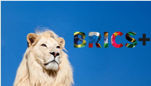
Africa and the 2024 BRICS Summit: Executive Summary