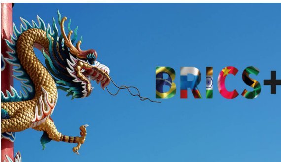
Southeast Asia and the 2024 BRICS Summit: Executive Summary

This article is accessible in the following languages: